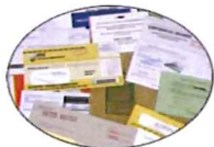
Mixed Paper, Envelopes with windows