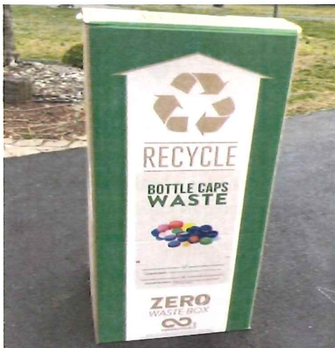
Zero Waste Boxes—(Small metal caps, candy wrappers, straws)