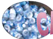
Plastic Beverage Bottles and Milk Jugs Plastic Takeout Containers