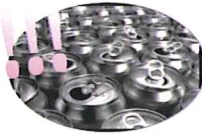
Aluminum and Metal Beverage Cans Food Cans